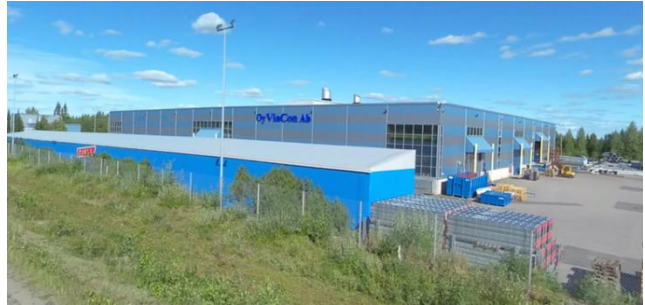
Fig. 1. Oy ViaCon Ab manufacturing plant located in Vimpeli (Finland).

Oy ViaCon Ab it's a part of the international ViaCon Group. The ViaCon Group is a provider of flexible corrugated steel structures and plastic pipes used to build Bridges & Culverts, GeoTechnical- and StormWater Solutions, covering the construction, reconstruction, and relining of culverts, bridges, viaducts, grade separations, wildlife crossings, tunnels, etc. that are used for establishing infrastructural connections and crossings. The ViaCon Group was founded in 1986 in Sweden and Norway, operates on European market.