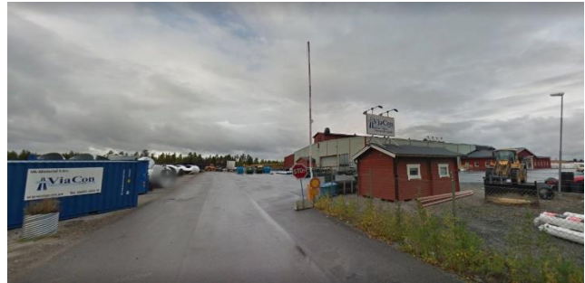
Fig. 1. ViaCon AB manufacturing plant located in Lycksele (Sweden).

The ViaCon Group is a provider of flexible corrugated steel structures and plastic pipes used to build Bridges & Culverts, GeoTechnical- and StormWater Solutions, covering the construction, reconstruction, and relining of culverts, bridges, viaducts, grade separations, wildlife crossings, tunnels, etc. that are used for establishing infrastructural connections and crossings. The ViaCon Group was founded in 1986 in Sweden and Norway, operates on European market.