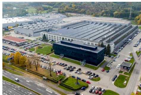
Fig. 1. A view of the Aluprof S.A. production hall in Bielsko-Biała.

Aluprof S.A. sells its solutions to most European countries and to the USA. The company has representative offices and distribution centres across Europe: in Germany, Great Britain, Ukraine, the Czech Republic, Hungary, Romania, Denmark and also in the USA.