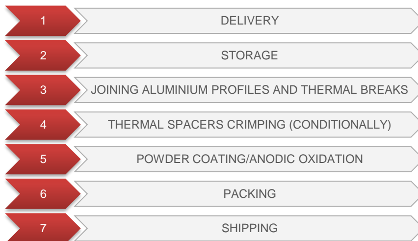
Fig. 3. A scheme of manufacturing of facade systems by Aluprof S.A. in factory in Bielsko-Biała (Poland).

The production process at the plant in Bielsko-Biała begins with the delivery of aluminum profiles produced in the press. Then, after unpacking, the profiles are joined together with the thermal break in special profiles joining machines. Subsequently, the thermal separators are crimped, but not in every case. After joining and crimping, profiles can be found in one of the two paint shops - vertical or horizontal, where they are subjected to the painting process. After drying, they are packed and then transported to the customer.