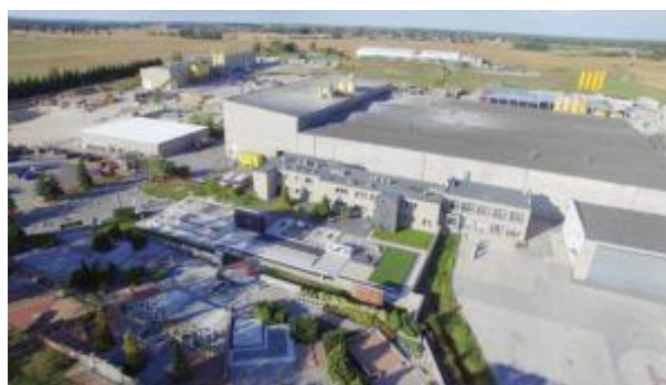
Fig. 1. A view of the POZ BRUK Sp. z o.o. Sp. j. production hall in Sobota (Poland).

POZ BRUK Sp. z o. o. Sp. j. is a Polish manufacturer of broad range of construction products with nearly 35 years of experience in the production of concrete prefabricated elements. The company established in 1985, gradually transformed from a workshop into manufacturing company possessing machine parks in 5 factories in central, north-western and western Poland.