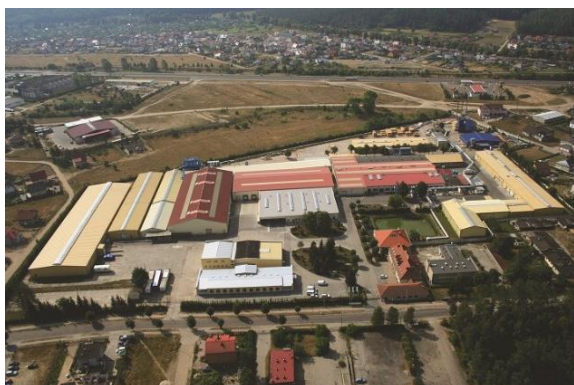
Fig. 1. A view of the Porta KMI Poland Sp. z o.o. Sp. k. production hall in Bolszewo

Porta KMI Poland Sp. z o. o. Sp. k. is a Polish door manufacturer. The company was established in 1992 and currently employs approx. 1800 people. Porta KMI Poland Sp. z o. o. Sp. k. operates in production plants located in Bolszewo, Ełk, Suwałki and Arad (Romania). It produces over 85,000 internal, entrance, external and technical doors by month. As part of the new business strategy adopted, the company operates in accordance with the idea of open business, cooperation and development.