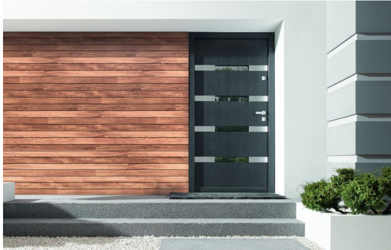
Fig. 2. Examples of exterior doors manufactured by Porta KMI Poland Sp. z o. o. Sp. k.