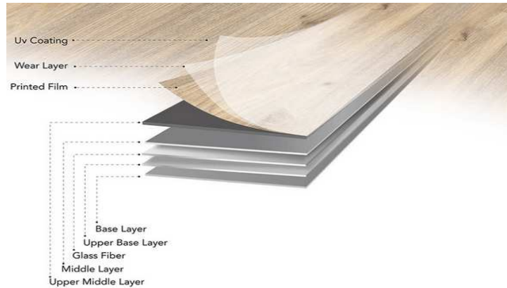
Figure 1. Example cross section of ADO floor product

of alkaline earth metal (barium or calcium) and zinc salts of fatty acids. These are viscous liquids. Finish is polyacrylate UV cured lacquer. Inks are used to print the decorative patterns. A cross-section diagram (multi layers) of an example product is presented in the figure 1.