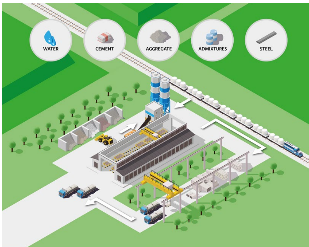
A scheme of manufacturing of the prefabricated filigree slabs by Pekabex BET S.A.