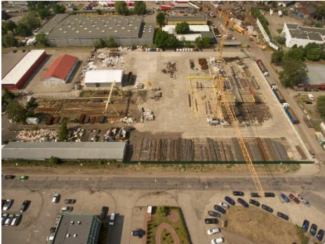
Fig 1. A view of TOM2 Sp. z o.o. in Szczecin (Poland).

TOM2 Sp. z o. o. is a manufacturer of construction reinforcements as well as a supplier of steel products. An additional area of business for the company is the production of spatial figures such as: columns, beams and piles. In the business seat in Szczecin, TOM2 has own modern machine park which ensures the production of elements in any shapes. The monthly manufacturing capacity of the rebar shop amounts to 2,000 tonnes of processed output. There are about 5,000 tonnes of steel on continuous sale in our warehouses. TOM2 accomplishes sales volumes which exceed 50,000 tonnes of steel per year and also deals with the sale of steel products.