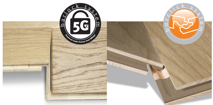
Fig. 2. Views of Barlinek floorboards with 5Gc BARLOCK and BARCLIK systems