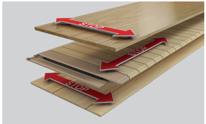
Fig. 1. Cross structure of 3-layer wooden floorboard produced by Barlinek Inwestycje Sp. z o.o.

Barlinek floorboard is made from three layers of real wood arranged in a cross structure (Fig. 1) in order to prevent swelling, squeaking or drying out causing splits. The cross construction reduces natural tension and compression of wood, provides a balance between the layers of the board, and thus guarantees the stability of the floor. The Barlinek floorboard's layered structure is suited for underfloor heating. The floorboards are joined using 5Gc joints and Barclick (Fig. 2) which allow to lay the floor without most of the tools which are usually necessary to install a floor. Specification of the product is shown in Table 1.