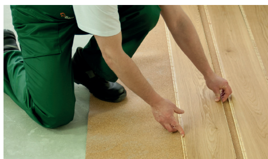
Fig. 3. The view of 3-layer wooden floorboard produced by Barlinek Inwestycje Sp. z o.o. during installation

The Barlinek floorboard can be installed in a floating system, that is glueless and based on modern tongue-and-groove joints. It is a method, that allows to install the floor yourself. The floor is also easy to be dismantled or re-installed. An alternative is to install the floor in a traditional way - by gluing the boards to the subfloor, which ensures stability of the installation even on large surfaces. The Barlinek floorboard does not require any additional preservative treatment. The floor is ready for use immediately after installation. The performance of the product is listed in Table 2.