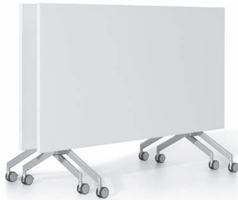
Table top: melamine faced chipboard, thickness 25 mm. Available in several dimensions. Legs: steel square profiles Frame: steel square profiles Glides: plastic

Convenio meeting table is made of fixed table top, steel tubular legs connected with steel a frame.