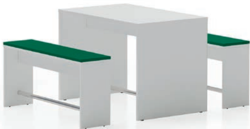
Table top: melamine faced chipboard, thickness 38 mm. Available in several dimensions Slab-end legs: melamine faced chipboard, thickness 38 mm Linking panel: melamine faced chipboard, thickness 19 mm Foot bar: stainless steel tube

Convenio meeting table is made fixed table top, slab-end legs connected with a linking panel and a foot bar.