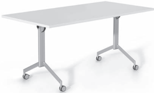
Table top: melamine faced chipboard, thickness 25 mm Legs: steel rounded profiles Beam: steel tube

Convenio mobile table is made of foldable table top and epoxy coated steel base that consists of two legs connected by a beam.