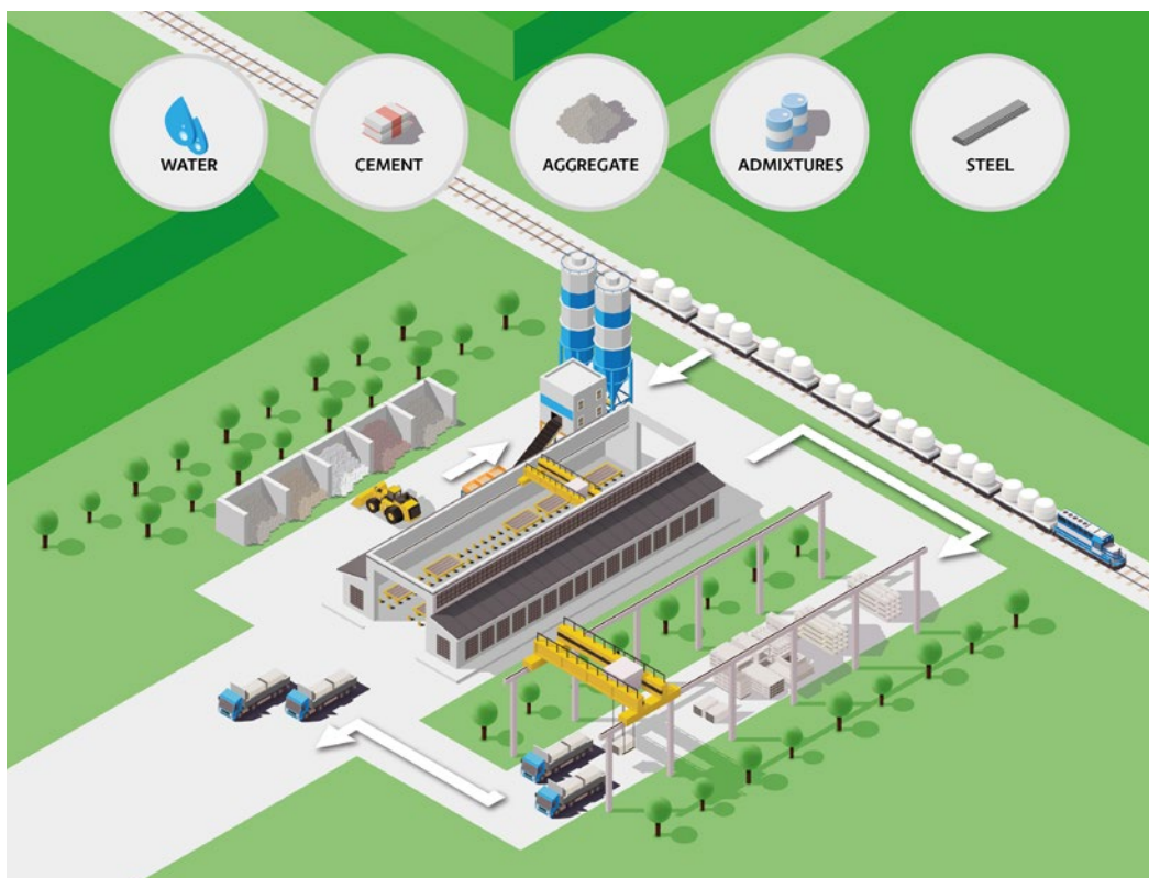
A scheme of manufacturing of the prefabricated filigree slabs by Pekabex BET S.A.