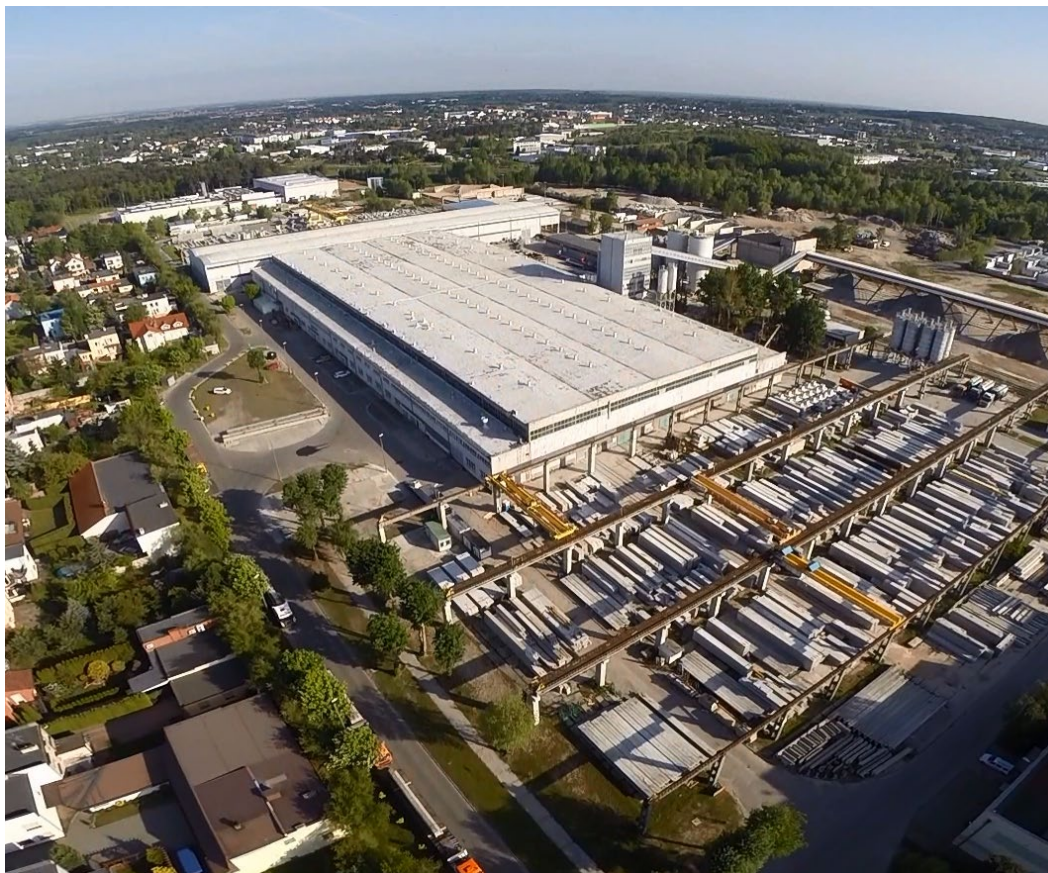
Fig 1. A view of Pekabex S.A. (Poland).

The company produces traditional reinforced elements, as well as modern prestressed elements used in enclosed structures (e.g. production and storage halls, offices, trade objects, railway stations, parking places), engineering objects (e.g. bridges, tunnels), and atypical designs. We offer wide range of standard products and realize special orders for individual designs. Pekabex S.A. possesses six production plants located in Poznań, Gdańsk, Bielsko-Biała, Mszczonów and Marktzeuln.