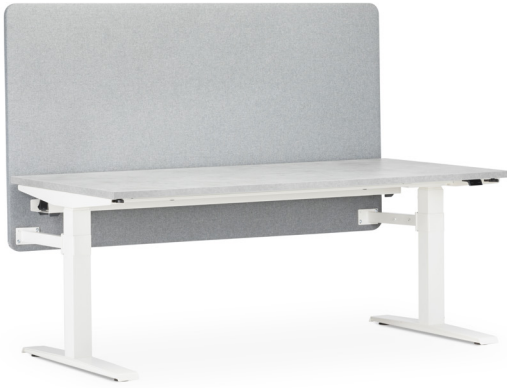
TABLE TOP TYPES: fixed or sliding

TABLE TOP SHAPES: rectangular, double wave, L-shape