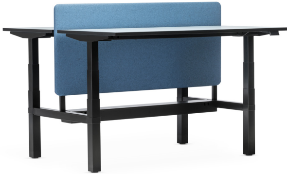
TABLE TOP TYPES: fixed or sliding