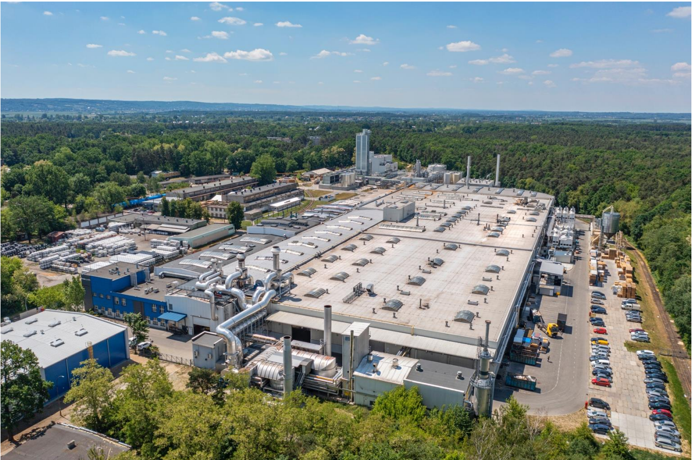
Fig. 1. A view of Kronospan HPL Sp. z o. o. in Pustków (Poland).

Kronospan Compact Interior CGS boards are manufactured in Pustków. In 1996, Kronospan started its operations there. The factory was established on the basis of one of the then existing departments of the local company - the laminate production department. In 1996-2006, the company underwent a series of complex technological changes related to the production of laminates. As a result of these changes, a new production plant was established, which uses the latest technological, technical and product solutions in the production of decorative laminates, countertops, compact boards or facade panels.