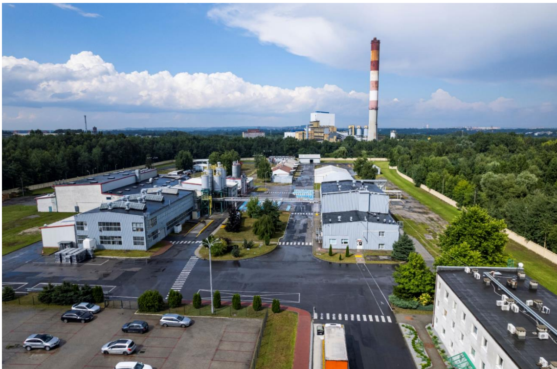
Fig. 1. A view of the MINOVA EKOCHEM Sp. z o.o. production plant located in Siemianowice Śląskie (Poland)