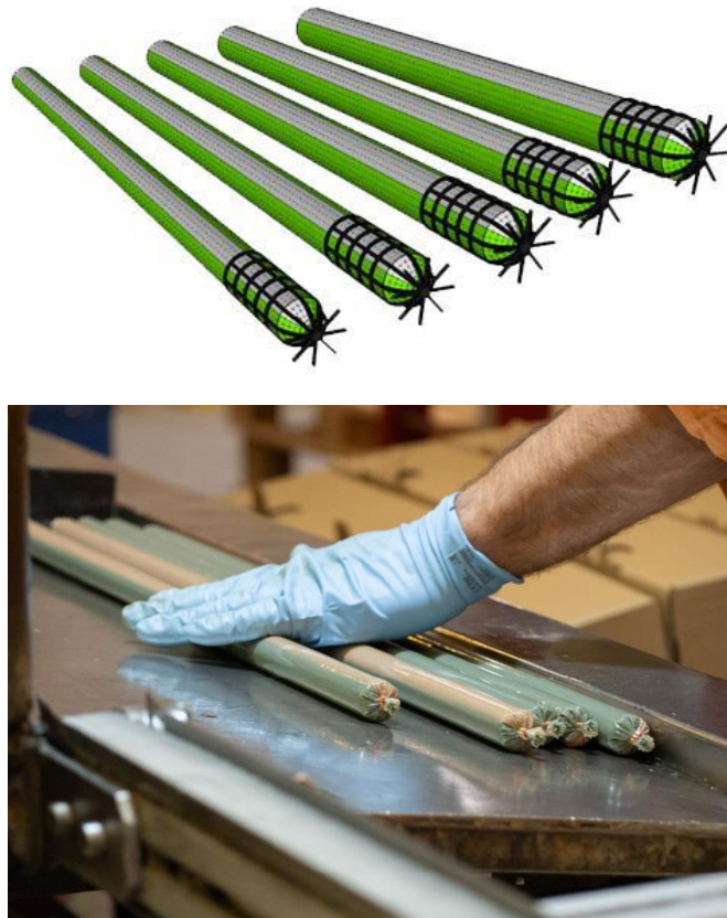
Figure 2. Illustrative (upper) and production (lower) picture of the Lokset resin capsules

More information about Lokset resin capsules can be found on the MINOVA EKOCHEM Sp. z o.o. website www.minovaglobal.com