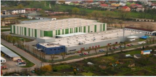
Fig 1. A view of Armacell Poland Sp. z o.o. factory in Środa Śląska (Poland).

Armacell Poland Sp. z o.o. factory in Środa Śląska is one of 20 owned by Armacell GmbH and is specialized in production of technical insulation systems (ArmaFlex, Armafix, Tubolit), protective systems (Arma-Check), metallic protective systems (Okabell), acoustic insulation systems (ArmaFlex and Tubolit), fire protection systems (ArmaFlex), adhesives and accessories.