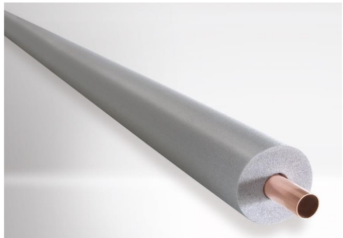
Fig. 2. Tubolit DG Plus insulation.

According to the European Chemicals regulation (REACH) manufacturer, importers and downstream users must register their chemicals and are responsible for their safe use on their own. For its production Armacell uses registered and approved substances/mixtures. Tubolit DG Plus does not contain substances to be mentioned according to EU regulation No 1907/2006 (REACH) annex II.