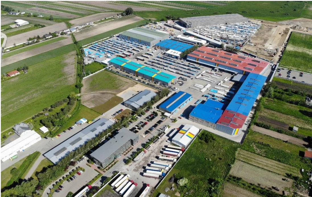
Fig. 1. A view of the Pruszyński Sp. z o.o. production hall in Sokółów (Poland).

Pruszyński Sp. z o. o. the Polish producer of construction products. The core of the activities are: steel roofing, elevation, trapezoidal steel sheets, sandwich panels and cold-formed profiles.