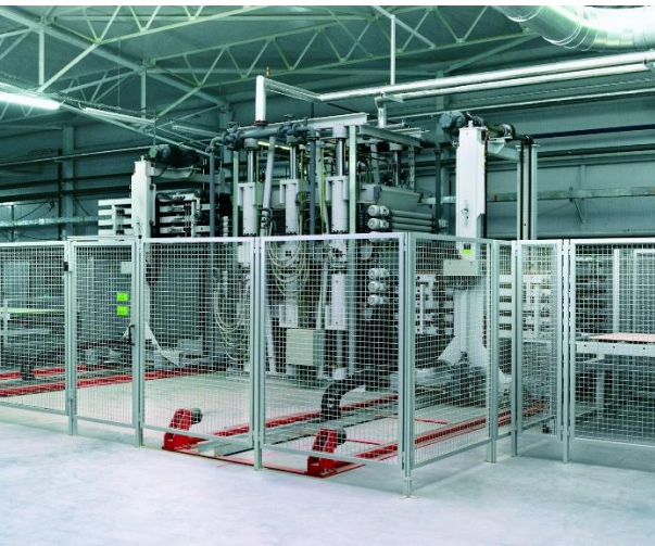
Fig. 1 Manufacturer production line.