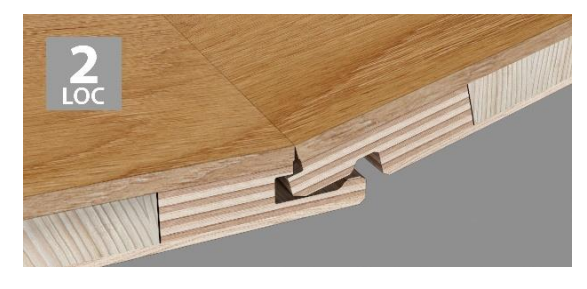
=> joint system 2LOC

Capability to freely expand and contract in the horizontal plane. Possible assembly and disassembly of the floorboards. Optional locking of 5G boards (only on the long side of the board). Installation over an underfloor heating system is possible. Installation in the floating and glue-down systems.