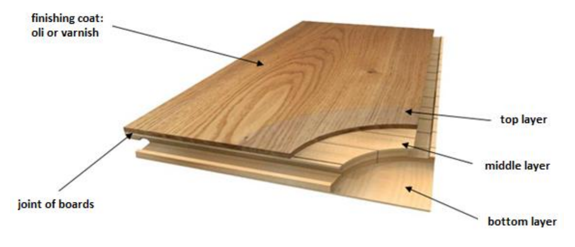
Fig. 2 Construction of a three-layer wooden floorboard offered by Moland A/S.

The wooden floorboards consists of three layers (Figure 2). A layer of usable surface (from 2.7 - 6.6 mm) is covered with varnish seven times or oil twice. Both finishes form a thin, flexible and durable protective layer on the floor surface. The middle layer (from 6.0 mm -16.0 mm) consists of transversely arranged spruce slats that strengthen the flexibility of the floor. The bottom layer (approx. 1.8 mm) is made of a uniform spruce veneer, which stabilizes and stiffens the whole structure. The basic technical parameters and properties of the products are listed in Table 1 and Table 2.