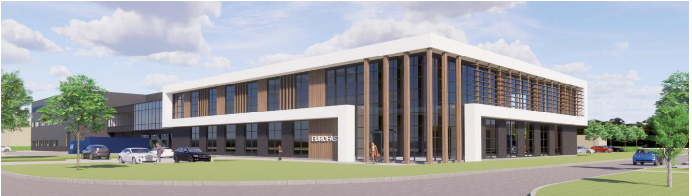
Figure 1: The view of VAN ROIJ FASTENERS EUROPE B.V.