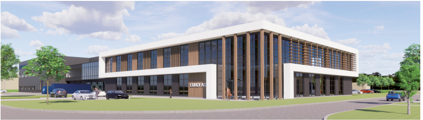
Figure 1: The view of VAN ROIJ FASTENERS EUROPE B.V. factory