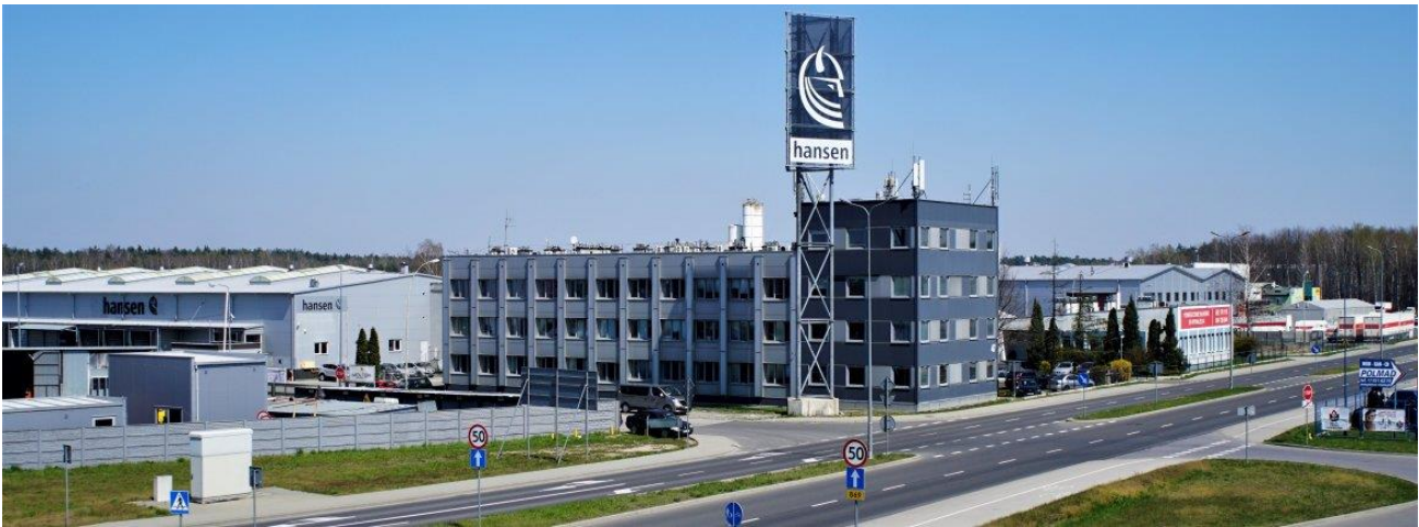
Fig. 1. Hansen Polska manufacturing plant located in Głogów Małopolski, Poland.

Hansen Polska is the manufacturing plant within the group. The company is located in Głogów Małopolski, Poland (Fig. 1). The production facilities including warehouse covers an area of 7 800 m 2 .