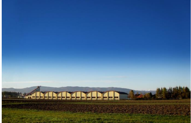
Figure 1 The view of GLOBAL SYSTEM Sp. z o.o. manufacturing plant

GLOBAL SYSTEM is a manufacturer of fire curtains and loading systems with a manufacturing plant located in Brzezna (Poland). The core products offered by the company are: fire rated rolling curtains, horizontal sliding fire doors, vertical fire doors. The company also offers movable and fixed smoke curtains. Apart from fire rated solutions, company produces loading systems with a full range of accessories used in loading technology for industry, sectional and roller doors and high-speed doors. GLOBAL SYSTEM has over twenty years of experience in the sale of its products.