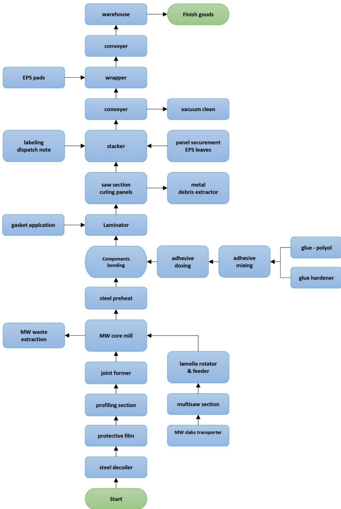
Figure 2. The scheme of metal faced insulating panels with mineral wool core production process by Kingspan Sp. z o.o.