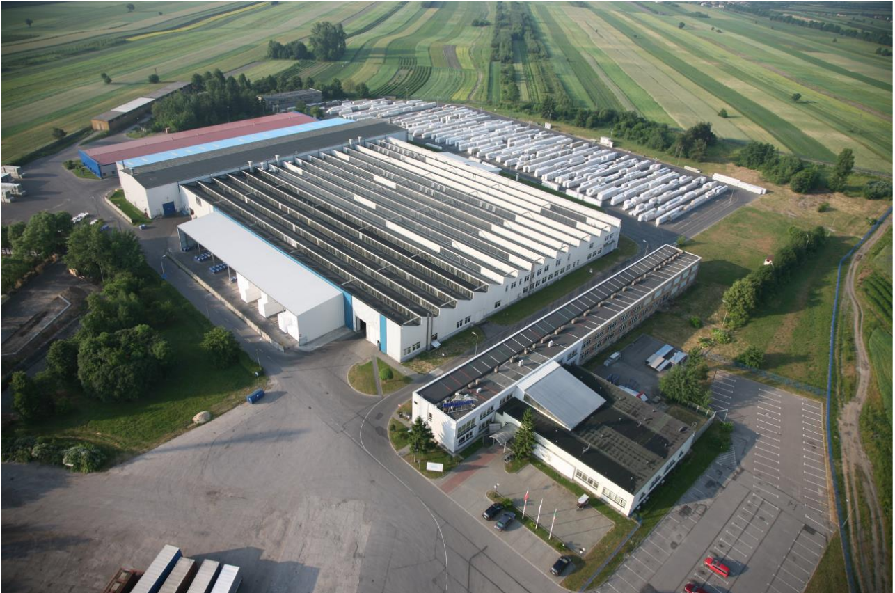
Figure 1. A view of the Kingspan production plant located in Lipsko (Poland).

Kingspan Sp z o.o. has been on the market since 2003 with the headquarters located in Lipsko (Fig.1). Kingspan exports products to almost 50 countries across five continents. The company specializes in the production of construction materials, including sandwich panels with both MW and PIR insulation core, modular coldrooms or coldstore doors. Moreover, Kingspan offers also a wide variety of ancillaries supplementing building envelope.