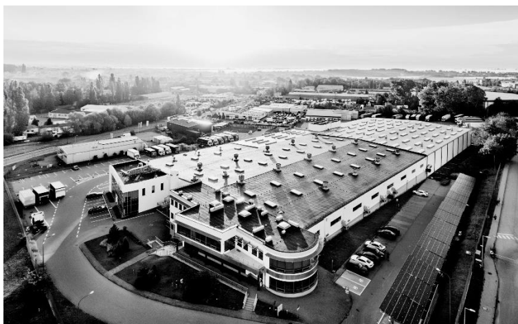
Figure 1 The view of Investa Sp. z o.o. office and manufacturing plant

Investa Sp. z o. o. located in Pruszcz Gdański was founded in 1989 and has supplemented its range of steel, stainless steel and aluminum products with a wide range of services in the area of sheet metal processing. By joining the Amari Group, Investa was able to improve its position on the Polish market and today it is one of the leading companies in the industry. Investa supplies steel, stainless steel products to industrial plants, medium-sized suppliers and manufacturing companies as well as craft workshops.