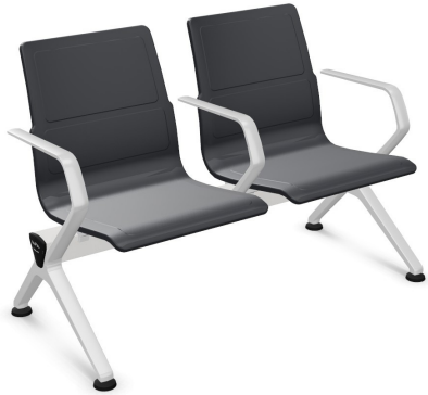
V-TRAVEL BENCH 2U

Environmental Product Declaration Type III ITB No. 581/2023