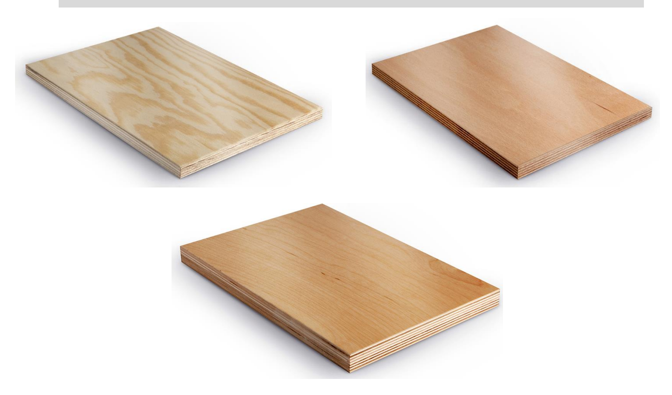
Fig. 2. A pine plywood sheet (top, left side), beech plywood sheet (top, right side) and birch plywood sheet (bottom) produced by Sklejka – Multi.