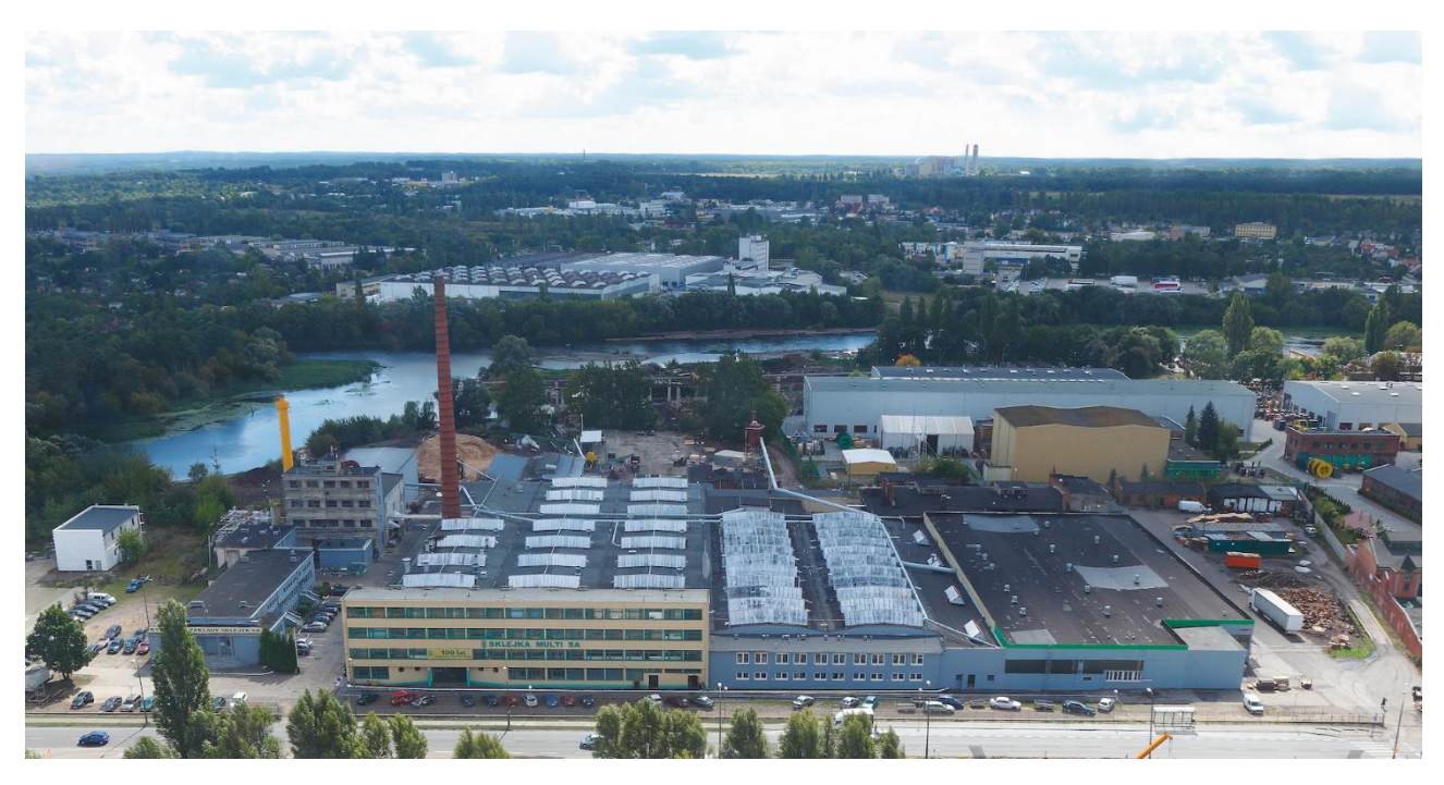
Fig. 1 A view of Bydgoskie Zakłady Sklejek "Sklejka-Multi" S. A. production plant located in Bydgoszcz (Poland).

Bydgoskie Zakłady Sklejek "Sklejka-Multi" S. A. is located in Bydgoszcz, Fordońska 154 Street. The area of the production plant, auxiliary departments and the office part occupies 64 052 m². The company has existed since 1914. The main recipients are domestic customers and customers of European countries: Germany, Sweden, Denmark, Austria, the Netherlands, Belgium, Norway, Hungary, France, Spain, Great Britain, Israel. The main products are general-purpose plywood with a raw surface, plywood covered with surface films and flame retardant plywood. We use birch, pine, beech and alder wood to produce plywood. Plywood is classified in accordance with the requirements contained in PN-EN standards, both in terms of technical requirements and surface appearance. Plywood is used in the production of furniture, interior design, construction, production of packaging, transport boxes, for building means of transport (buses, railway wagons), etc.