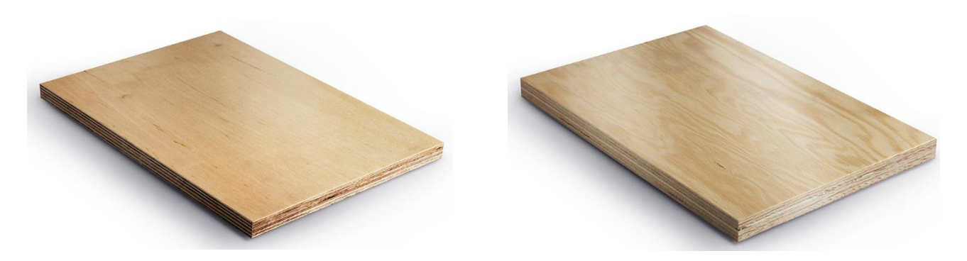
Fig. 2. A birch flame retardant plywood sheet (left) and pine flame retardant plywood sheet (right) produced by Sklejka – Multi.