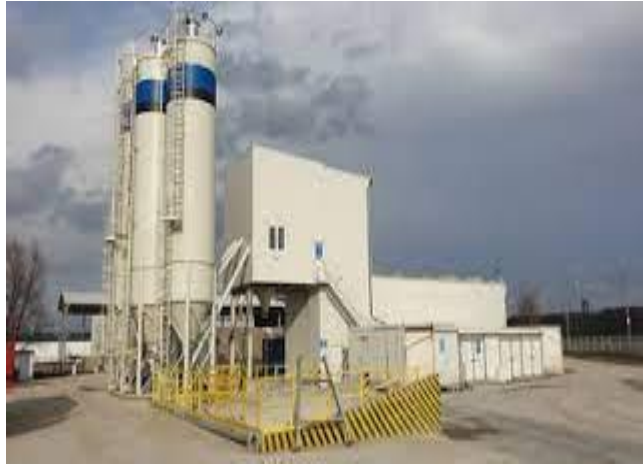
Figure 1 The view of one of manufacturing plant

Dyckerhoff Polska Sp. z o. o. is concrete producer with plants located in Poland. Dyckerhoff Polska is part of Buzzi Unicem and belongs to the management area of the Eastern Dyckerhoff Division. Buzzi Unicem is an Italian-based corporation with plants in 13 countries and almost 10,000 employees worldwide. Dyckerhoff Polska is a recognized manufacturer of high-quality cements, ready-mix concretes and special products used in various areas of construction. The production of cement and special products takes place in the Nowiny Cement Plant, located in Nowiny near Kielce. The plant's production capacity is 1.6 million tons of cement per year. The company also has a terminal in Warsaw. Ready-mix specific concrete