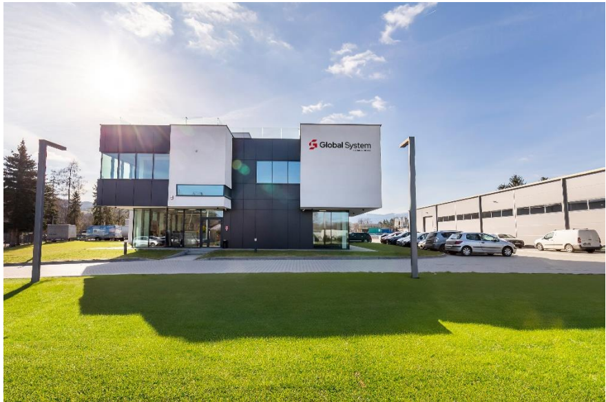
Figure 1 The view of GLOBAL SYSTEM Sp. z o.o. manufacturing plant

GLOBAL SYSTEM is a manufacturer of fire curtains and loading systems with a manufacturing plant located in Podegrodzie (Poland). The core products offered by the company are: fire rated rolling curtains, horizontal sliding fire doors, vertical fire doors. The company also offers movable and fixed smoke curtains. Apart from fire rated solutions, company produces loading systems with a full range of accessories used in loading technology for industry, sectional and roller doors and high-speed doors. GLOBAL SYSTEM has over twenty years of experience in the sale of its products. All of products are designed in accordance with the highest standards, health and safety regulations.