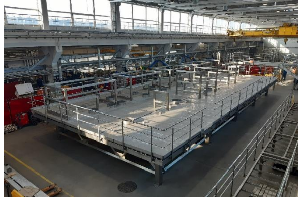
Figure 1. INSS-POL sp. z o.o. manufacturing plant located in Wrocław

INSS-POL operates in Poland, the EU and in many other countries worldwide.