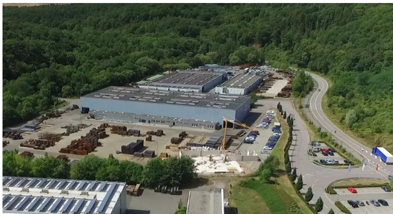
Figure 1 The view of MEISER Straßenausstattung GmbH manufacturing plant located in Schmelz – Limbach

In Schemelz – Limbach MEISER is capable to produce wide range of different steel, welded and galvanized elements, according to different and specific requirements such as EN1317, RAL RG 620, NF, Copro, Astra .