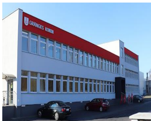
Fig. 1 The view of Gränges Konin S.A. plant in Konin

In 2020, the plant was taken over by Gränges AB and the Company's name was changed to Gränges Konin S.A. The annual production capacity of the plant in Konin is approximately 100 thousand tons of flat rolled products, and thanks to investments in both the foundry and rolling mill departments, the plant's annual production capacity in 2025 is to increase to 140 thousand tons of rolled products.