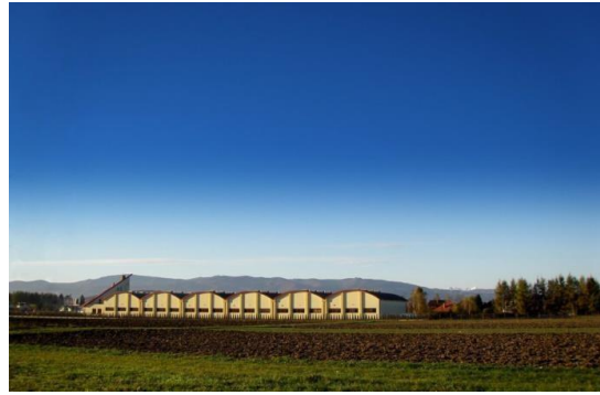
Figure 1. Manufacturing plant in Poland

HOEFNAGELS FIRE SAFETY is a supplier of fire curtains with a manufacturing plant located in Podedgrodzie (Poland). The core products offered by the company are: fire rated rolling curtains, horizontal sliding fire doors, vertical fire doors. The company also offers movable and fixed smoke curtains. HOEFNAGELS FIRE SAFETY has over 140 years of experience in the sale of its products. All of products are designed in accordance with the highest standards, health and safety regulations.