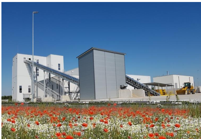
Figure 1 The view of SIL-PRO Warszawa Sp. z o.o. manufacturing plant

The company SIL-PRO Błoczek Silikatowy Sp. z o.o. appeared on the market of silicate products in 2009 in Godzikowice near Oława. Thus one of the most modern factories was established, which started production and sales of the highest quality silicate blocks. In response to the ever-growing demand as well as interest in the SIL-PRO brand, the company set its sights on its development and in 2019 a second SIL-PRO Warszawa Sp. z o.o. production plant was established located in Nowy Modlin near Warsaw. As a result, SIL-PRO has become a nationwide supplier of silicate blocks capable of handling even more construction investments.