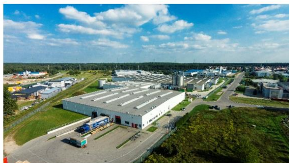
Manufacturing plant located in Elk 2

Porta KMI Poland S.A. operates in Bolszewo, Elk, Suwałki and Arad (Romania), producing over 85,000 exterior, entrance, interior and technical doors per month. As part of its newly adopted business strategy, the company operates in accordance with the principles of open business, cooperation and development.