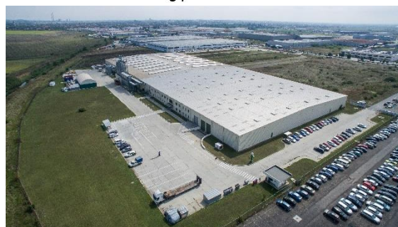
Manufacturing plant located in Romania