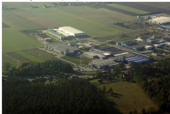
Manufacturing plant located in Suwałki