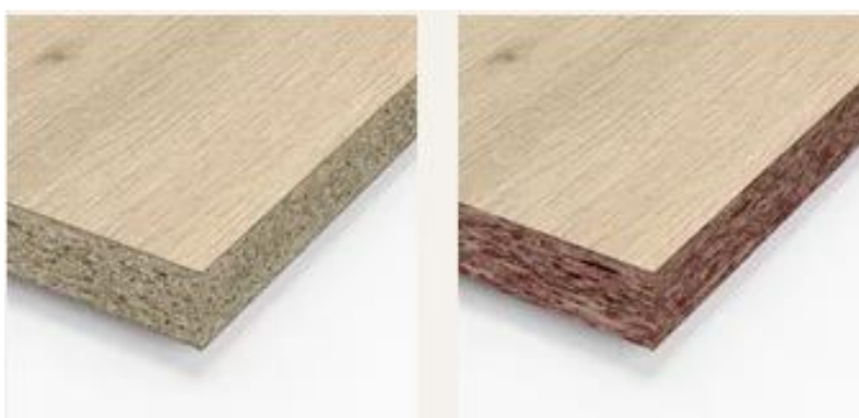
Fire resistant core