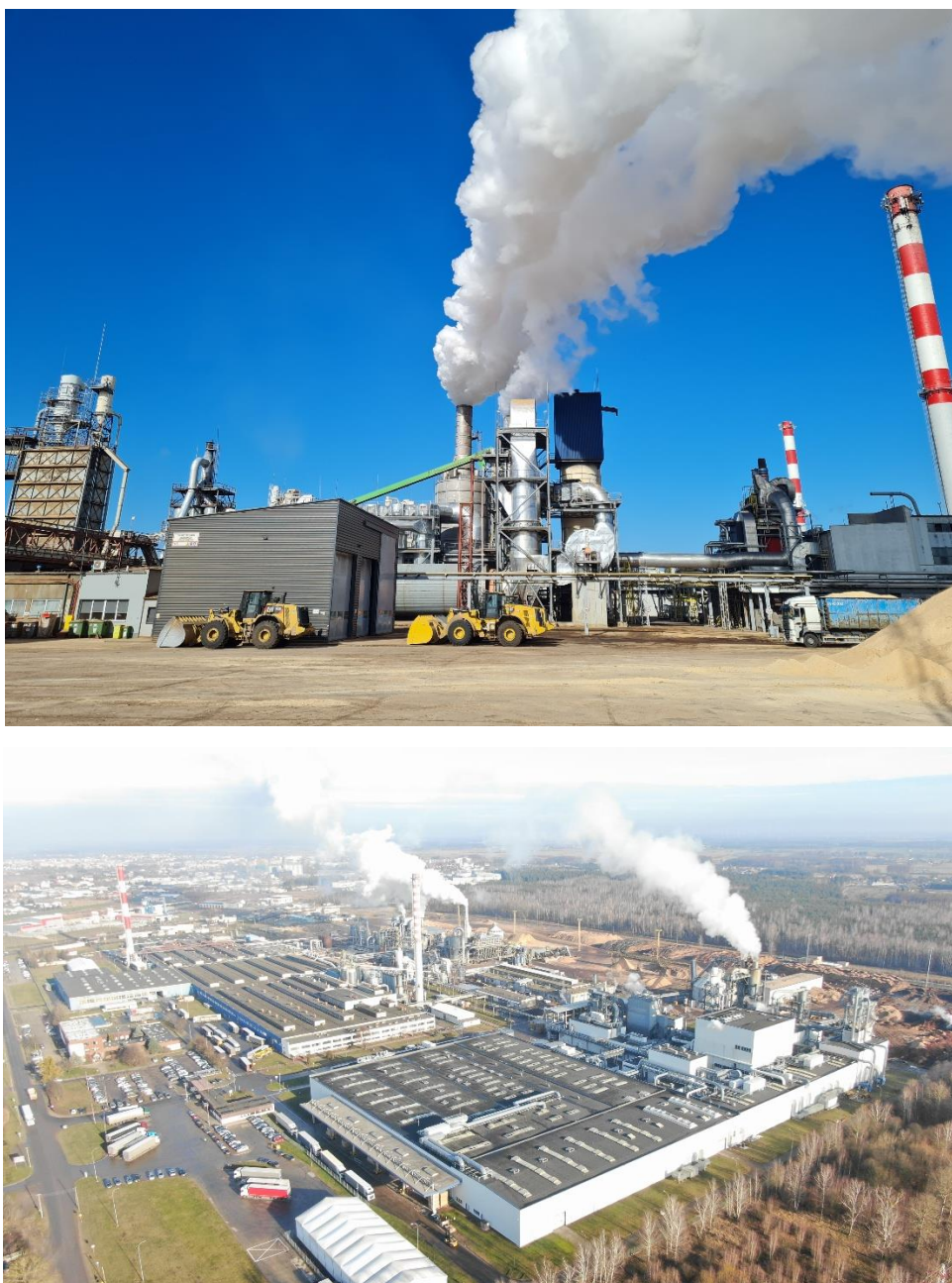
Fig.1 A view of Woodeco production plants.

Woodeco is a provider of solutions based on wood-based materials for the furniture, construction and interior finishing industries. The company offers full service to furniture companies, carpenter's workshops, architects and designers as well as companies in the construction industry. On the Polish market, the company's products are available, among others, which includes more than 80 retail outlets, in selected DIY chains or building materials distribution outlets. The company's offer includes a wide range of products in line with the latest trends in the design, construction, finishing and equipment of both private and public buildings.