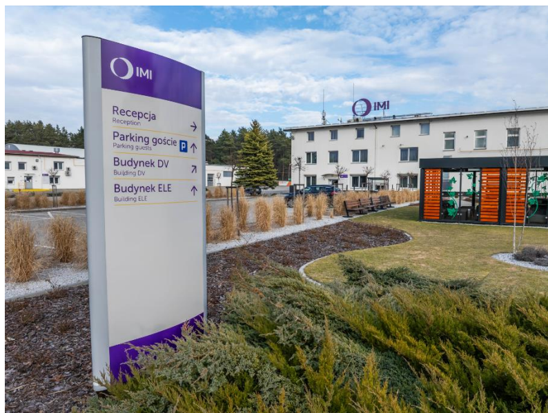
Figure 1 The view of IMI International Sp. z o.o. manufacturing plant located in Olkusz

Climate Control is leading HVAC solutions provider, with manufacturing sites located across the globe. Company is provider of technologies that deliver energy efficient water-based heating and cooling systems for the residential and commercial building sectors. Throughout the history, company have been at the forefront of HVAC industry innovation. The portfolio of brands has what is needed – a complete range of unique, industry-leading products and services. IMI Climate Control is a part of IMI PLC Group, listed on the London Stock Exchange on FTSE 100 list.