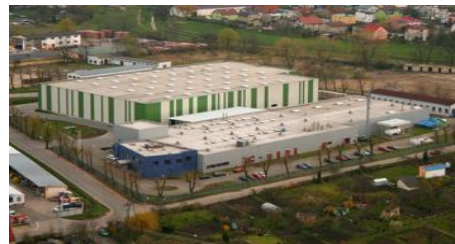
Fig.1. A view of factory in Środa Śląska (Poland)

Armacell International S.A. is owner of 26 manufacturing facilities and is specialized in production of technical insulation systems (ArmaFlex, Armafix, Tubolit), protective systems (Arma-Check), metallic protective systems (Okabell), acoustic insulation systems (ArmaSound and ArmaComfort), fire protection systems (ArmaProtect). Armacell International S.A. is a producer of flexible insulation foams for the equipment insulation market and a provider of engineered foams which operates two main businesses: