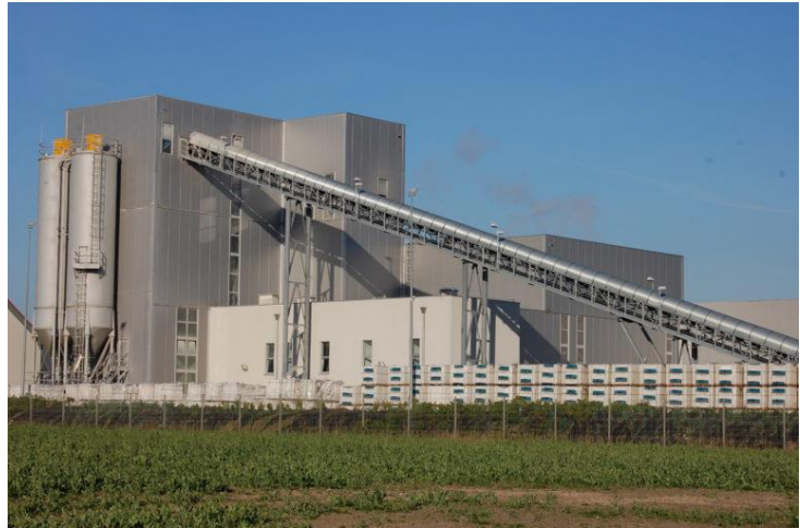
Figure 1 The view of SIL-PRO Bloczki Silikatowe Sp. z o.o. manufacturing plant

The company SIL-PRO Bloczki Silikatowe Sp. z o.o. appeared on the market of silicate products in 2009 in Godzikowice near Olawa. Thus one of the most modern factories was established, which started production and sales of the highest quality silicate blocks. In response to the ever-growing demand as well as interest in the SIL-PRO brand, the company set its sights on its development and in 2019 a second SIL-PRO Warsaw Sp. z o.o. production plant was established located in Nowy Modlin near Warsaw. As a result, SIL-PRO has become a nationwide supplier of silicate blocks capable of handling even more construction investments.