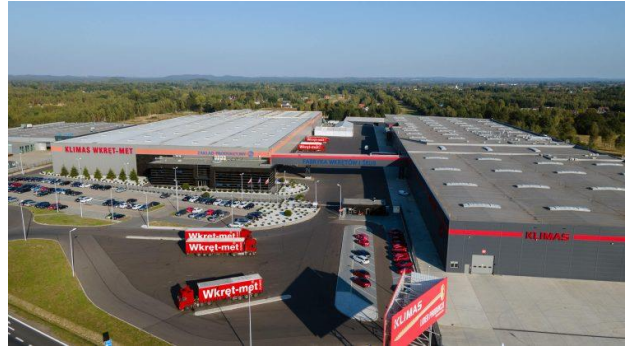
Figure 2 View from the Wkręt-met Sp. z o.o. manufacturing plants no. 2, 3, and 4 in Wanaty near Częstochowa

Wkręt-met Sp. z o.o. is a Polish manufacturer of fastening products for the construction sector. It operates 2 production locations in Poland (Manufacturing plant no.1 in Kuźnica Kiedrzyńska, Manufacturing plant no. 2, 3 and 4 in Wanaty) equipped with injection molding machines, presses, rolling equipment, CNC machining centers, high-bay storage, and quality control systems. The company provides comprehensive customer support throughout the fastening process.