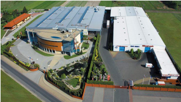
Figure 1 View from the Wkręt-met Sp. z o.o. manufacturing plant no. 1 in Kuźnica Kiedrzyńska